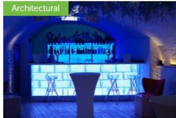
The Igloo Bar, UK > Constant voltage LED Drivers and RGB control