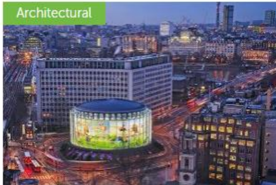
IMAX Waterloo, London > Constant voltage LED drivers and DMX control