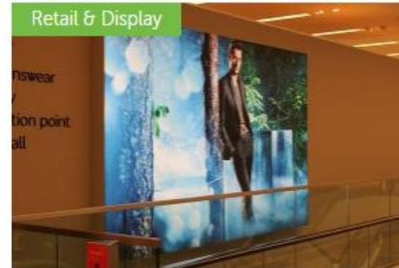
Marks and Spencer, Nationwide > Super-slim constant current LED drivers