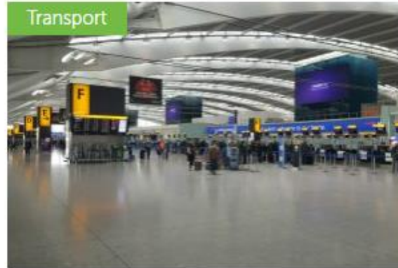
London Heathrow > LED lighting drivers, DALI control and emergency packs