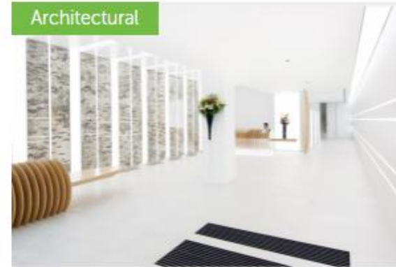
St James Square, London > Constant voltage LED drivers and Dimmable LED Drivers